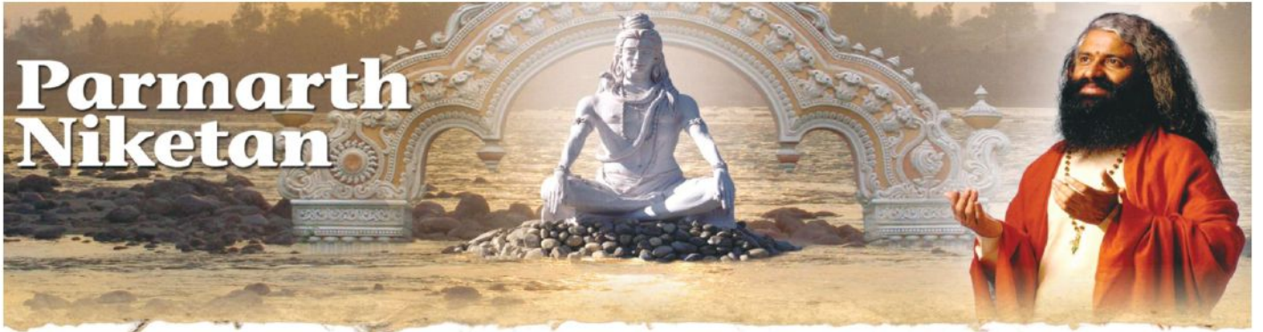
H.H. Pujya Swami Chidanand Saraswati President, Parmarth Niketan